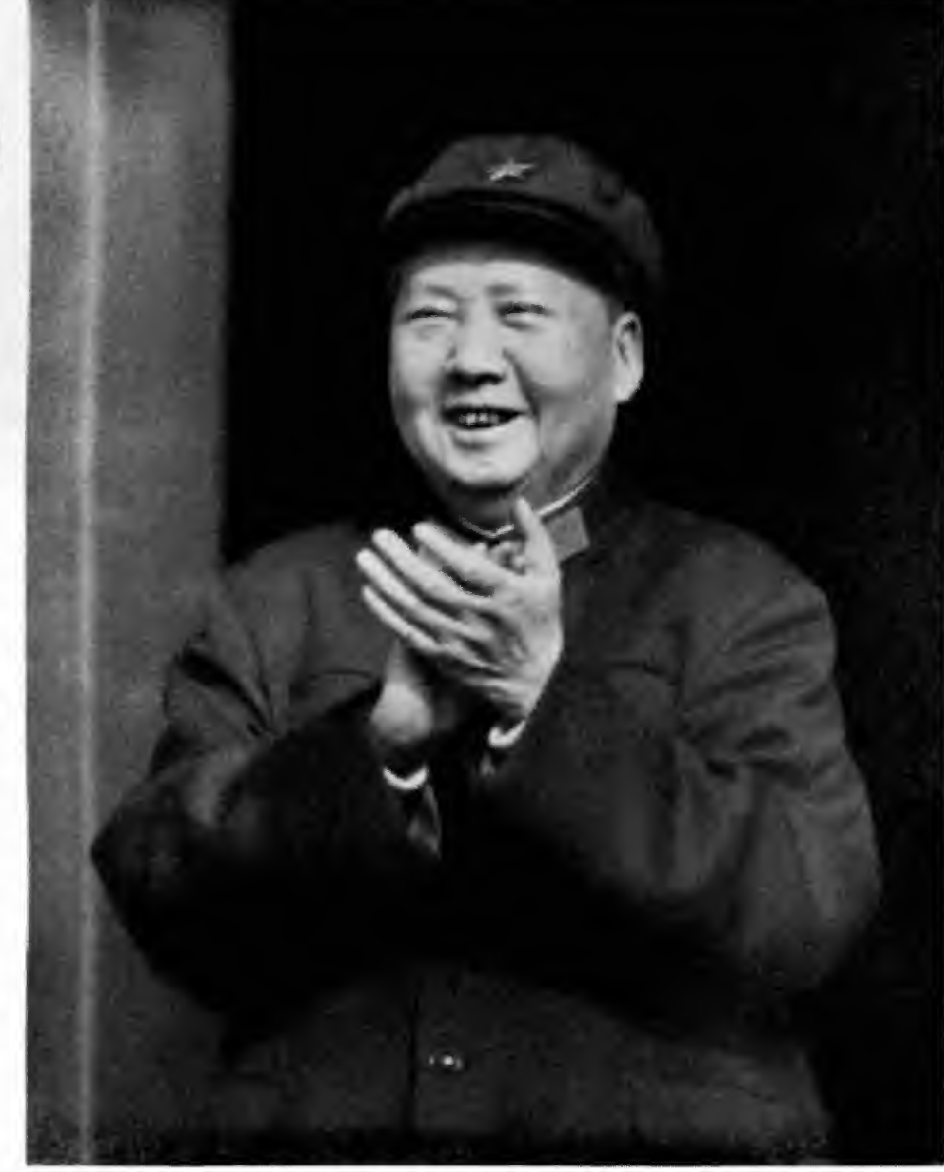
Chairman Mao applauds the Red Guards during the seventh review at Tien An Men Square.

man Mao's correct line, the broad revolutionary masses of our country have created the new experience of developing deep and extensive democracy under the dictatorship of the proletariat. With this broadest and most extensive democracy, the Party is fearlessly urging the broad masses to use every medium—the free airing of views, big-character posters, great debates and the widest exchange of revolutionary experience—to criticize and supervise the Party, government, leading institutions and leaders at all levels. At the same time, the people's democratic rights are being fully realized in accordance with the principles of the Paris Commune. This extensive democracy, said Comrade Lin Piao, is a new form of integrating Mao Tsetung's thought with the broad masses, a new form of mass selfeducation. It is a new contribution by Chairman Mao to Marxist-Leninist theory on proletarian